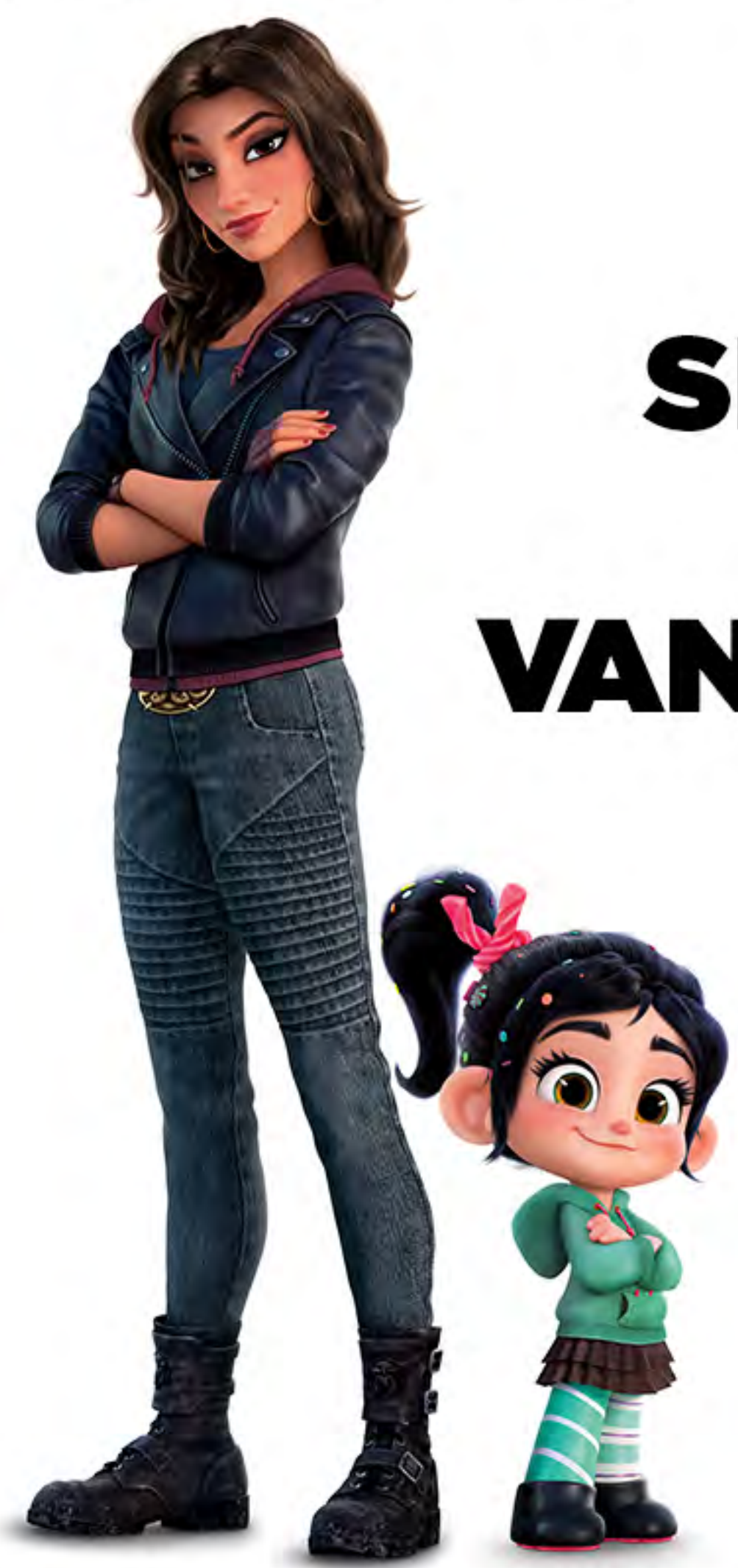
SHANK & VANELLOPE