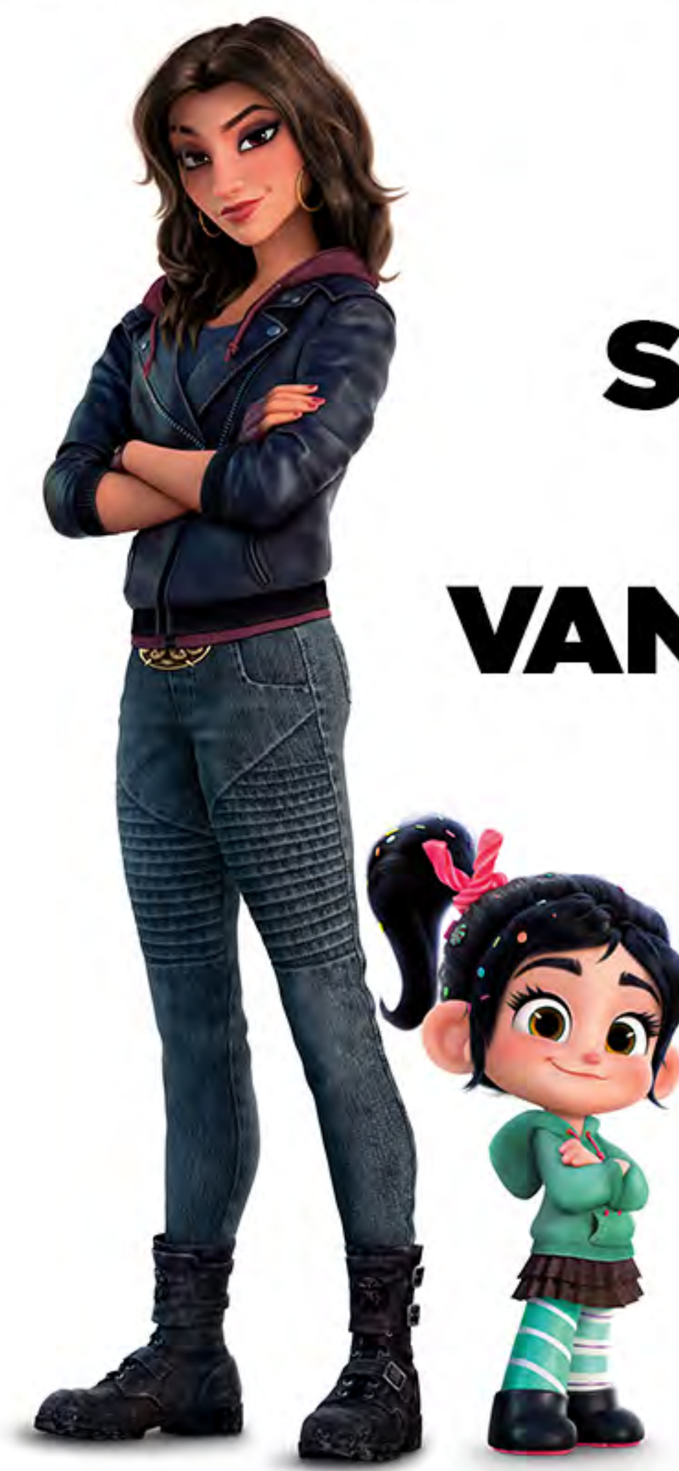
SHANK & VANELLOPE