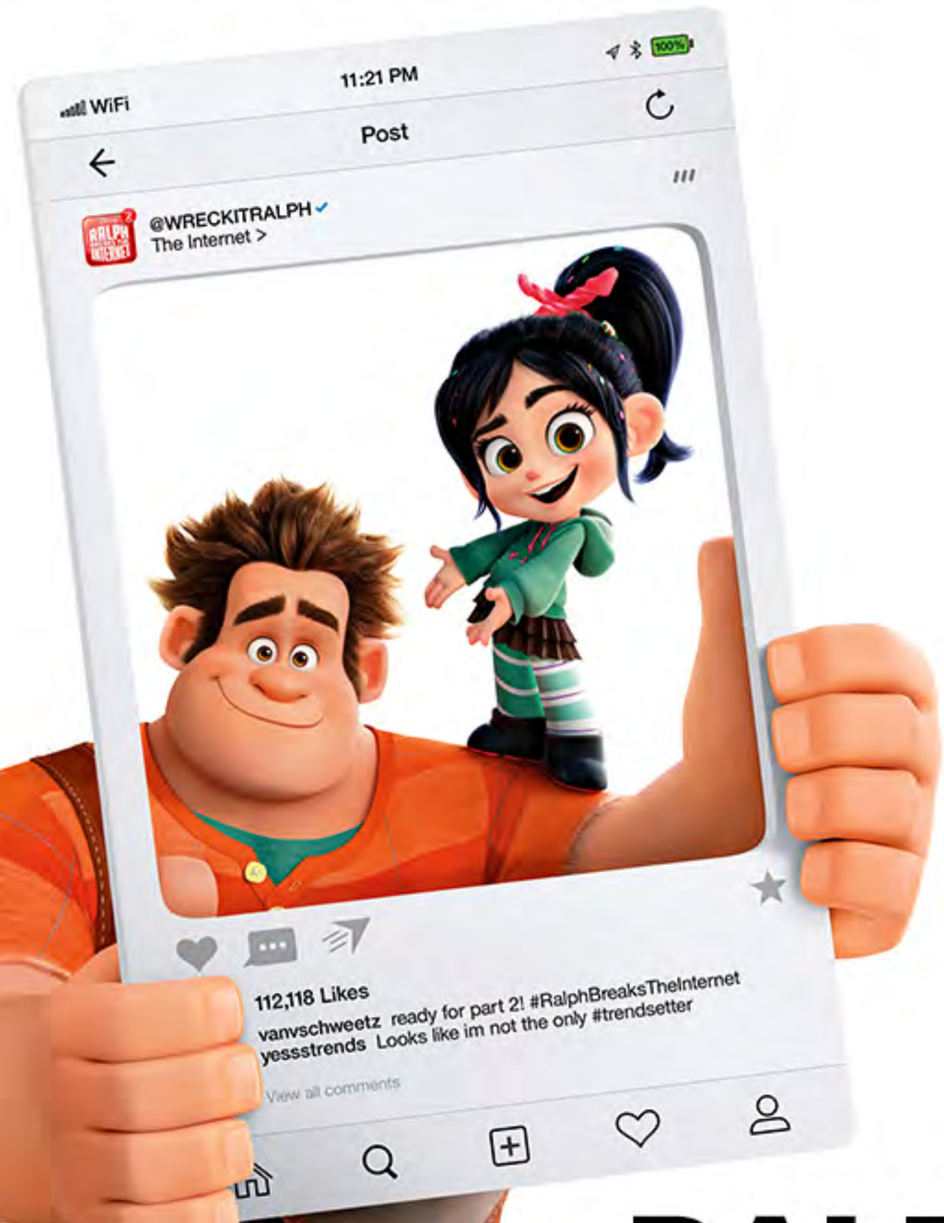
RALPH & VANELLOPE